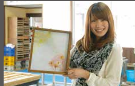
Make Echizen Washi Paper