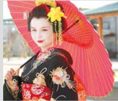
Geisha Kimono Dress-Up

Experience Japanese culture firsthand, including Zen meditation at Eiheiji Temple!