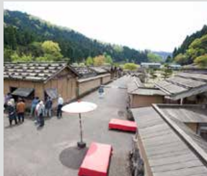
Ichijodani Asakura Clan Ruins