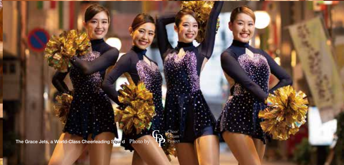
The Grace Jets, a World-Class Cheerleading Squad