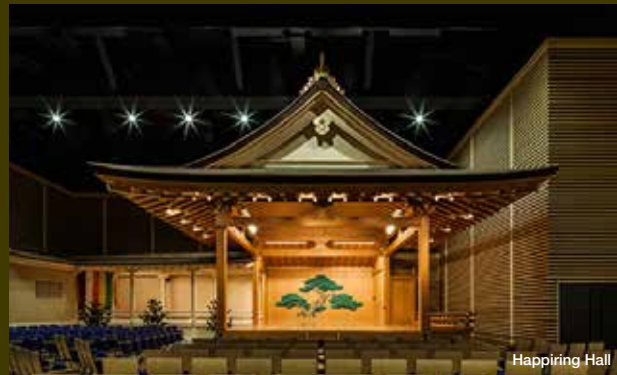
Unique MICE possibilities with a traditional Noh stage!