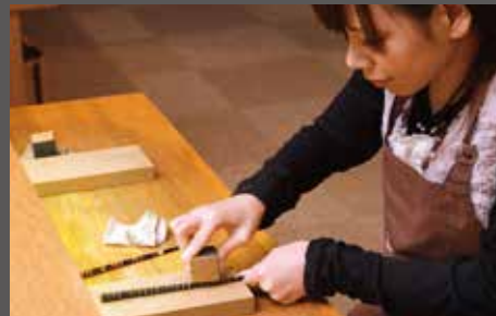
Make Wakasa Chopsticks

Fukui is known for traditional crafts and manufacturing — try making your own crafts as a one-of-a-kind souvenir!