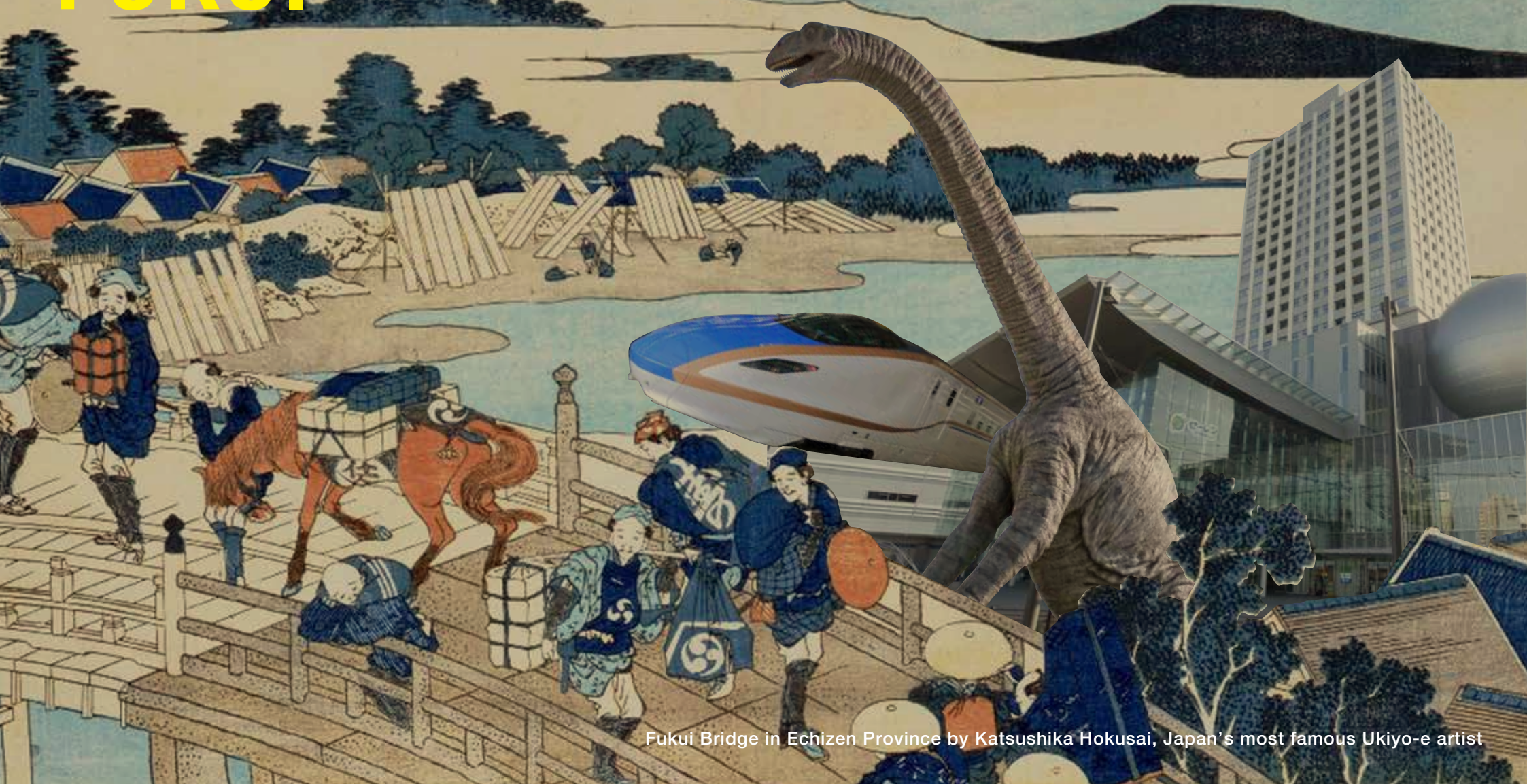
Fukui Bridge in Echizen Province by Katsushika Hokusai, Japan's most famous Ukiyo-e artist