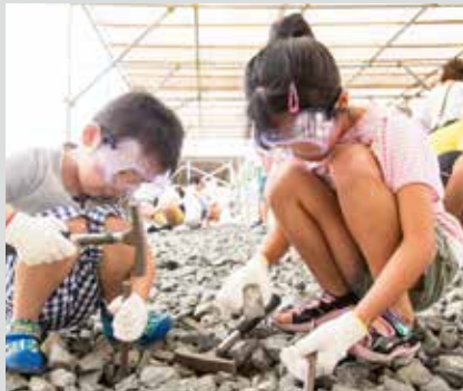
Excavating Fossils in Katsuyama