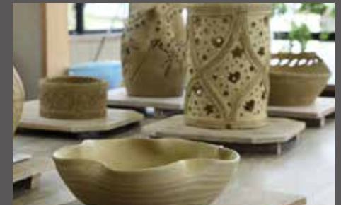
Make Echizen Pottery