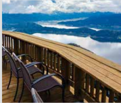
The Five Lakes of Mikata