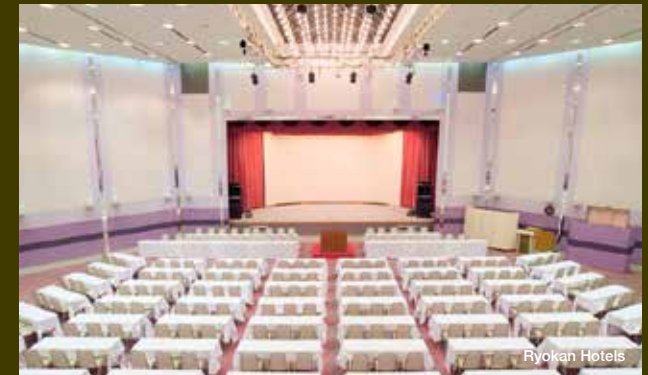
Superb convention venues at ryokan hotels