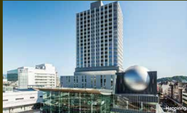
Distinctive, practical meeting sites near Fukui Station