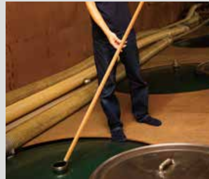
Sake Brewery Tours