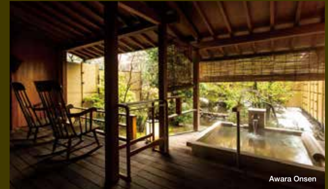
MICE in the hot spring town of Awara Onsen