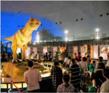
Fukui Prefectural Dinosaur Museum

Explore the ancient world of dinosaurs, visit beautiful scenery, and eat incredible food, all in Fukui!