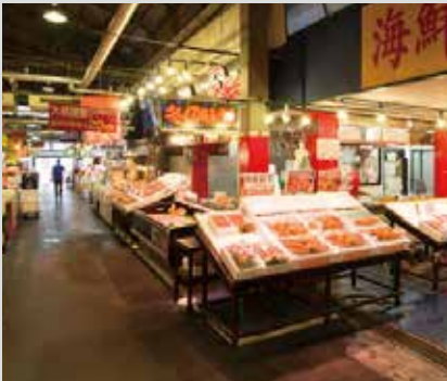
Seafood Market "Nihonkai Sakanamachi"