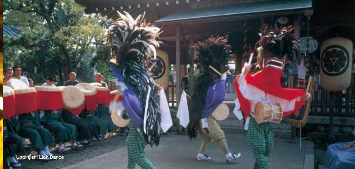
Unpinjishi Lion Dance