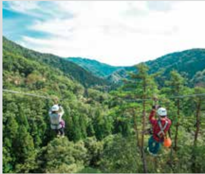
Tree Picnic Adventure Ikeda

From beaches to rivers to mountains, there's plenty to enjoy in the great outdoors all year round!