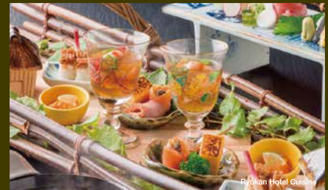
Sumptuous ryokan hotel meals